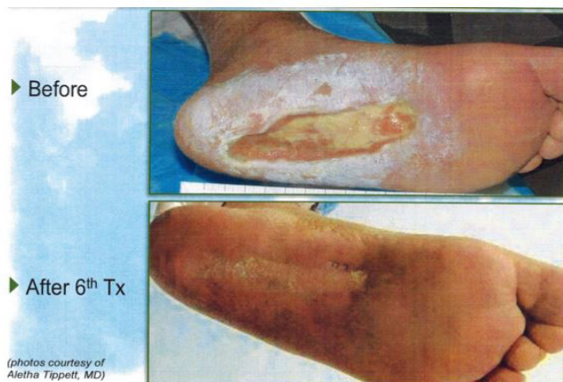
Figure 2: Laser therapy before therapy and after 6 weeks.

A second patient was a 65-year-old man with diabetes who was diagnosed with gas gangrene of the foot and was scheduled in the hospital for amputation. I met the surgeon outside the OR and begged him to do a wide debridement instead of amputation. He agreed and did a wide debridement of the foot. The next day I started treating the wound - we did use laser therapy once a week for six weeks and the pictures of beginning and after 6 weeks are shown here. Clearly the laser facilitated the healing and closure of his wound. This patient went on to totally heal his wound and was ambulatory and in fact went on a family vacation to Florida shortly thereafter (Figure 2).